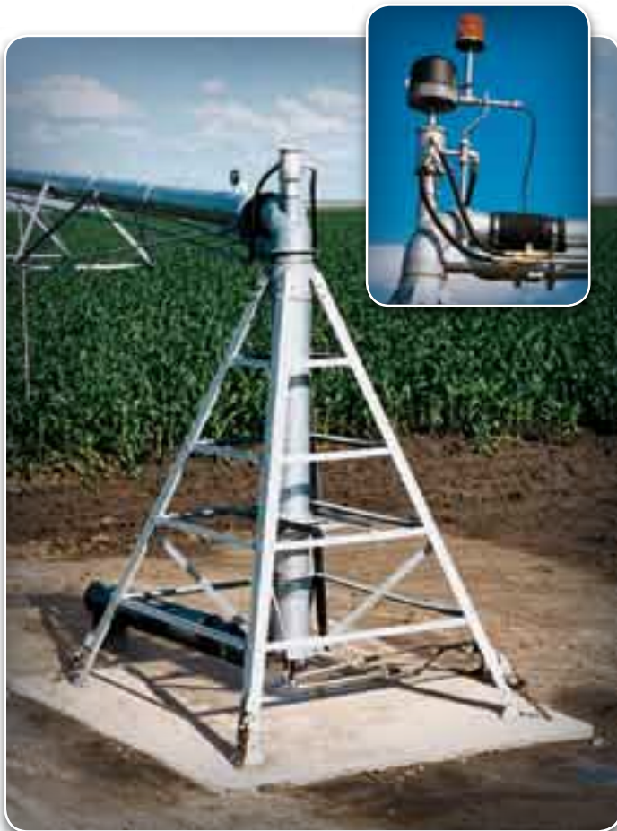
Pivot point available with hydraulic swivel or wrap hoses. Inset photo shown with collector ring and strobe light.

There is no wasted horsepower with a T-L because the power required to run the pump varies directly with the rotation time of the pivot. All T-L Irrigation Systems utilize non-toxic Hydroclear™ hydraulic fluid with an additive package specially designed to provide superior wear protection. The filtered hydraulic system assures long life.