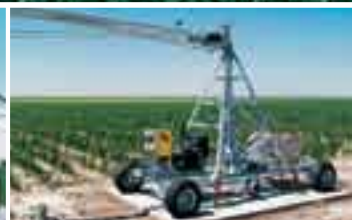
Four Wheel Towable Pivot Systems