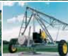
Quick Tow Systems