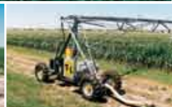
Two and Four Wheel Linear Systems