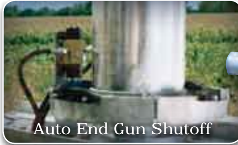
Auto End Gun Shutoff