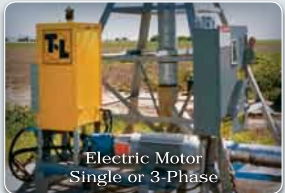
Electric Motor Single or 3-Phase