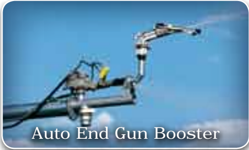
Auto End Gun Booster

T-L has options for any field, any crop.