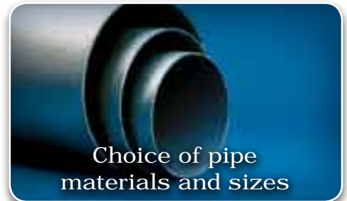
Choice of pipe materials and sizes

Stop your pivot at any degree of the circle with T-L's optional position stop.